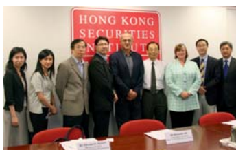
Lingnan University hosted the focus group discussions with senior industry representatives

books that have influenced and entertained our members. From The Aggressive Conservative Investor to Hands On, Hands Off, these books are judged to have been informative, enlightening, interesting and truthful about the industry in which we work. The list is a selected collection of the books reviewed in the Column 'Reading List' of the HKSI official Publication "Hong Kong Securities" in the year of 2007. The books selected for review will generally present but will not necessarily be limited to the work of acknowledged authorities on aspects of the investment and financial services industry, and hopefully will stimulate our readership as well as help them to make their own selections from the often bewildering range of publications they are faced with on the internet and in bookshops. Detailed book reviews written by our members and practitioners are available at www.hksi.org/journal .